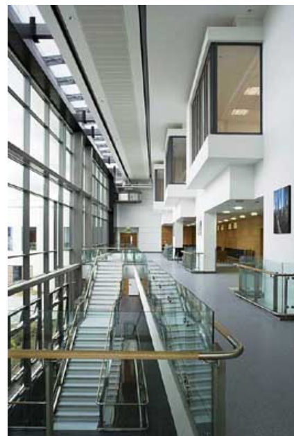
FRH Cancer and Renal Services Centre - Interior Level 3