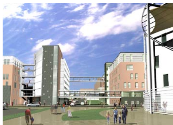
RVI Exterior (Artist's Impression)