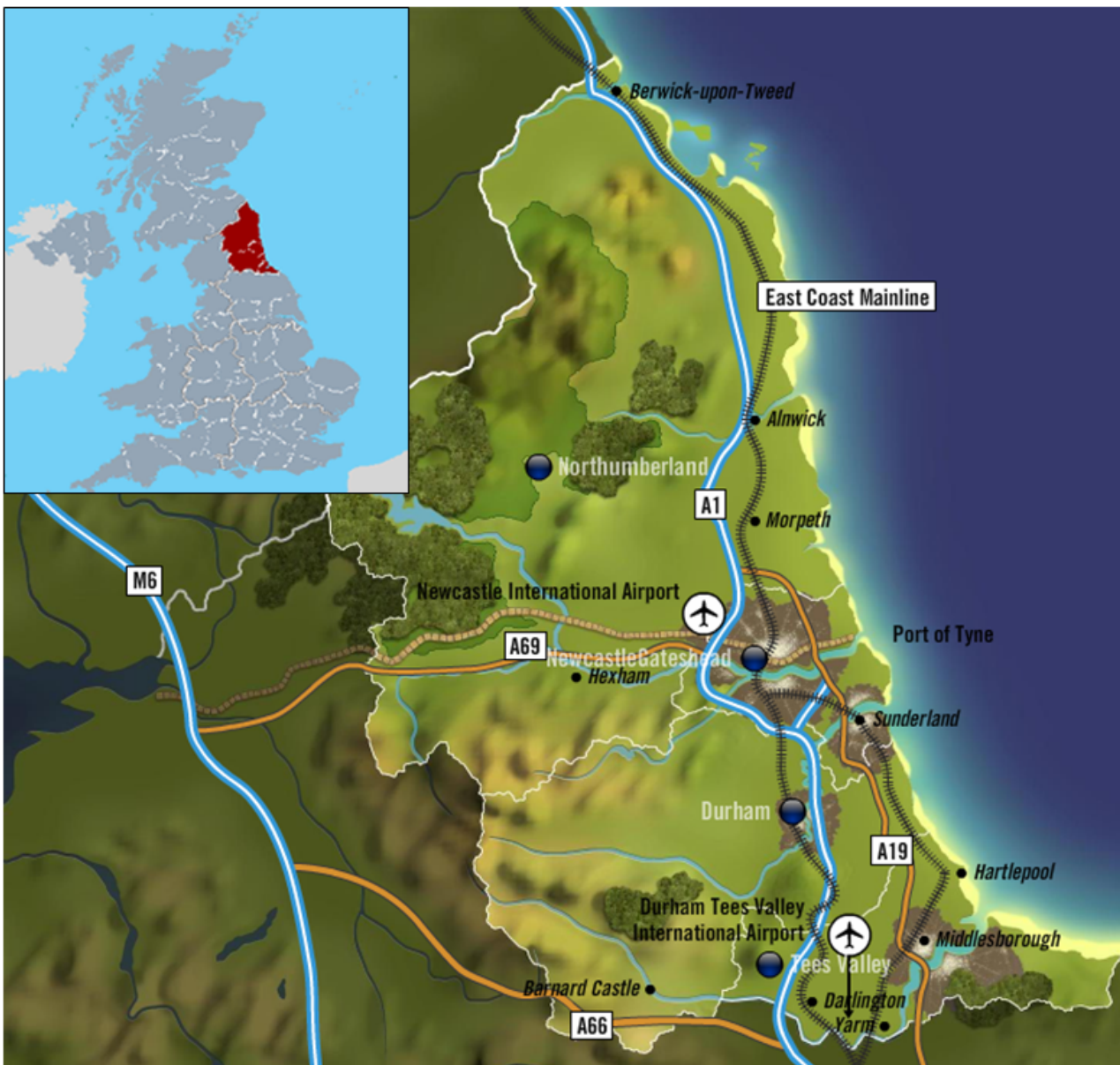
Northeast England map showing major roads, rail lines and airports

NewcastleGateshead is a vibrant and dynamic place, brimming with regeneration and energy, and you will be spoilt for choice whatever you enjoy - shopping, dining out or enjoying an evening of entertainment at one of the myriad of theatres, cinemas and music venues dotted across the region. The city itself is just minutes away from unspoilt countryside and miles of stunning Northumbrian coast, and the Lake District is a mere two hour drive across the north pennines. Affordable housing, great schools and easy traveling all promise an enviable lifestyle here in the North East.