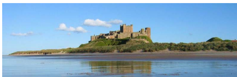
Bamburgh Castle, Northumberland

There are museums and libraries in plenty and art galleries, including the Laing with its fine permanent collection of British Art. The Theatre Royal is at the hub of a thriving theatre world and is regularly visited by the Royal Shakespeare Company. Across the iconic Gateshead Millennium Bridge, the BALTIC offers modern art whilst the Sage is a world class music venue.