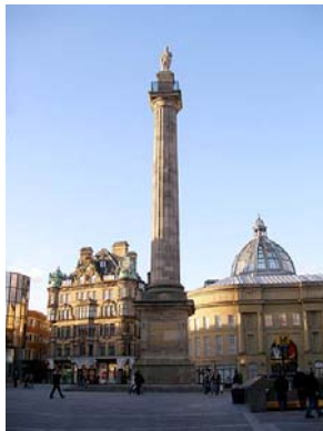
Grey's Monument, Newcastle upon Tyne

Once a medieval walled town - the base for continuous warfare with the Scots - it is steeped in history, evidenced by the old Norman Castle Keep, sturdy towers and parts of the embattled surrounding wall, now lovingly preserved. Fifteenth Century St Nicholas' Cathedral commands the approaches to a bustling riverside and the seven bridges that span the Tyne to the south.