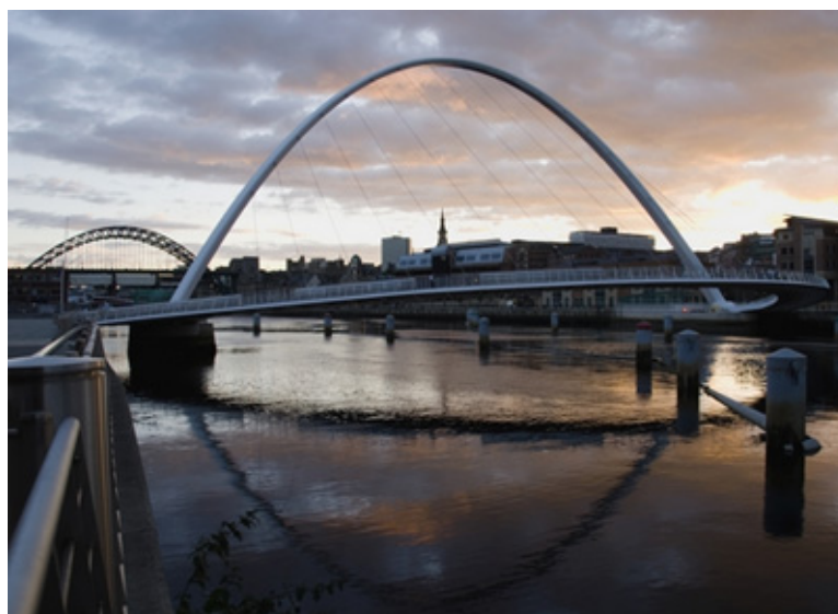
Newcastle upon Tyne through the Gateshead Millennium Bridge

As a department we aim to provide expert guidance and advice on any aspect of medication.