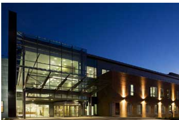
FRH Cancer and Renal Services Centre – Main Entrance