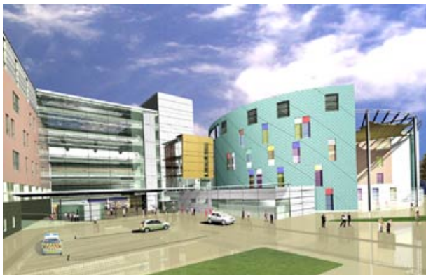
RVI Exterior including Great North Children's Hospital (Artist's Impression)

the RVI. This will replace the four current dispensaries across the RVI and NGH sites, and will complement the RVI's state-of-the-art Production Unit and associated Pharmacy Distribution Centre. In the same year the Great North Children's Hospital is due to open, also at the RVI site. At the FRH, construction of the new Northern Centre for Cancer Care and Renal Services Centre is complete with a new cytotoxic preparation suite and small dispensary for oncology and renal out-patients.